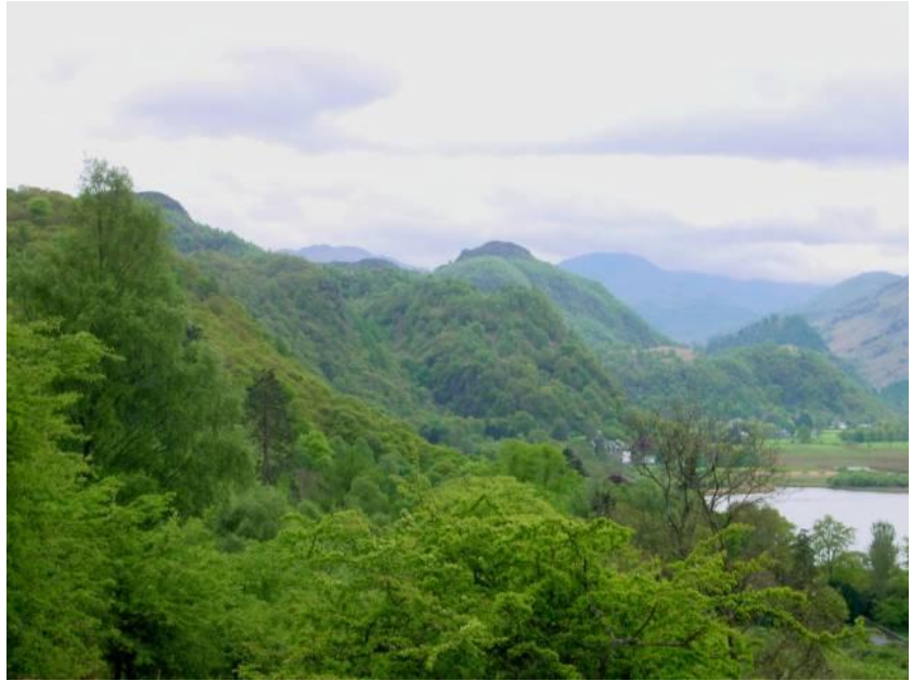
Borrowdale woods

Upland oak woodland Upland mixed ashwood Wet woodland