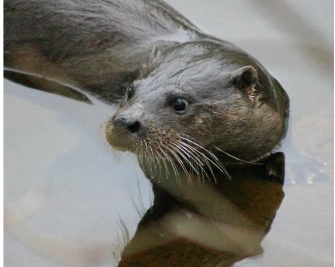
Otter

Legal and Conservation Status Habitat Ecology Distribution Conservation Issues Planning Considerations Enhancement Opportunities Further Information Contacts Current Action in Cumbria