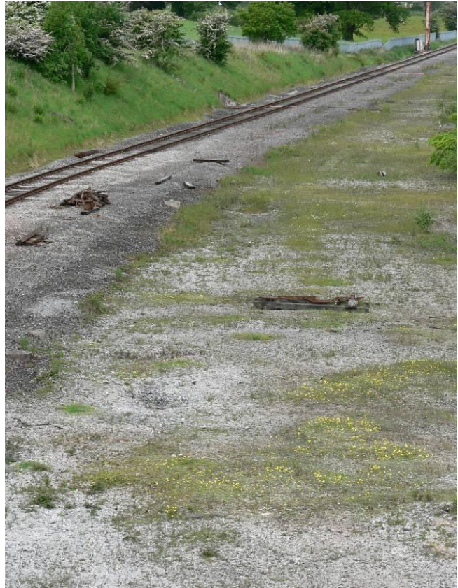
Kingmoor Marshalling Yard, Carlisle

Description Distribution and Extent Conservation Issues Planning Considerations Enhancement Opportunities Habitat Targets Key Species Further Information Contacts Current Action in Cumbria