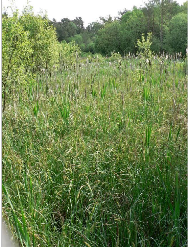
Basin mire, Cliburn Moss